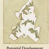
Potential Development Land