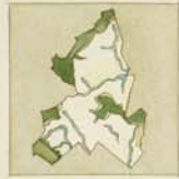
Forest, Wildlife and Water